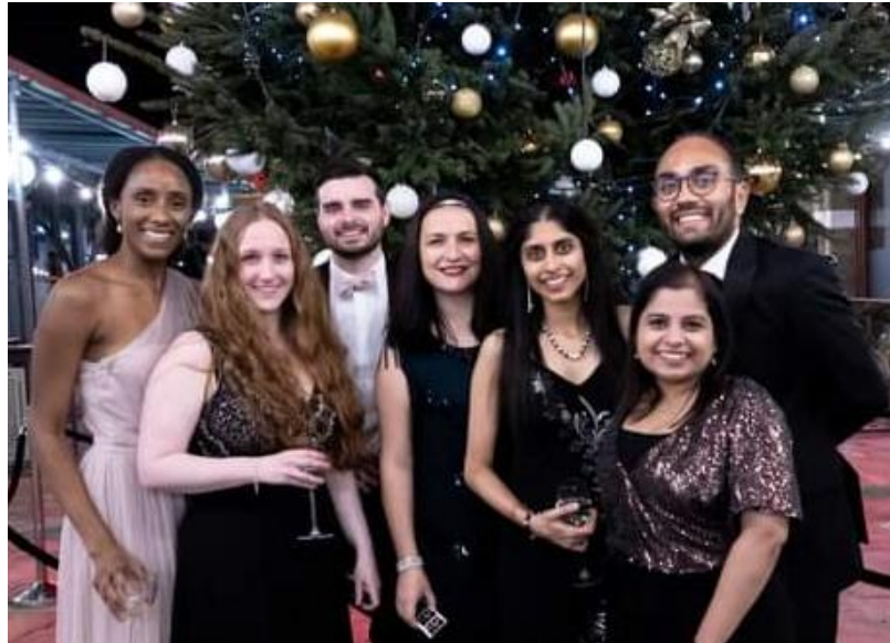
The committee at the 2021 Ball