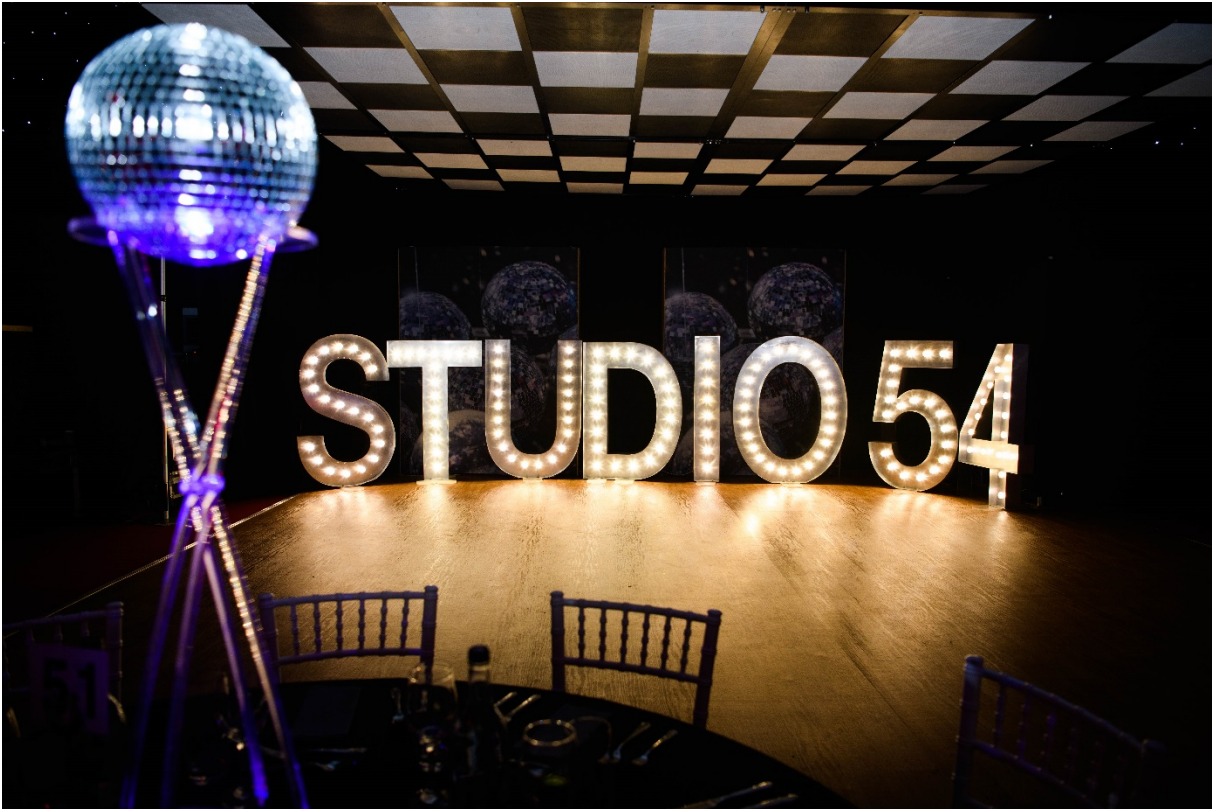
Main stage at the 2019 SIAS Ball