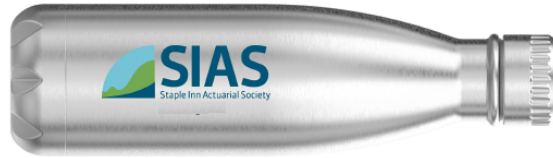
Custom SIAS Water bottle for #IrunwithSIAS participants

SIAS continued to offer opportunities to our members to fundraise for their favourite charities through running, getting active and studying!