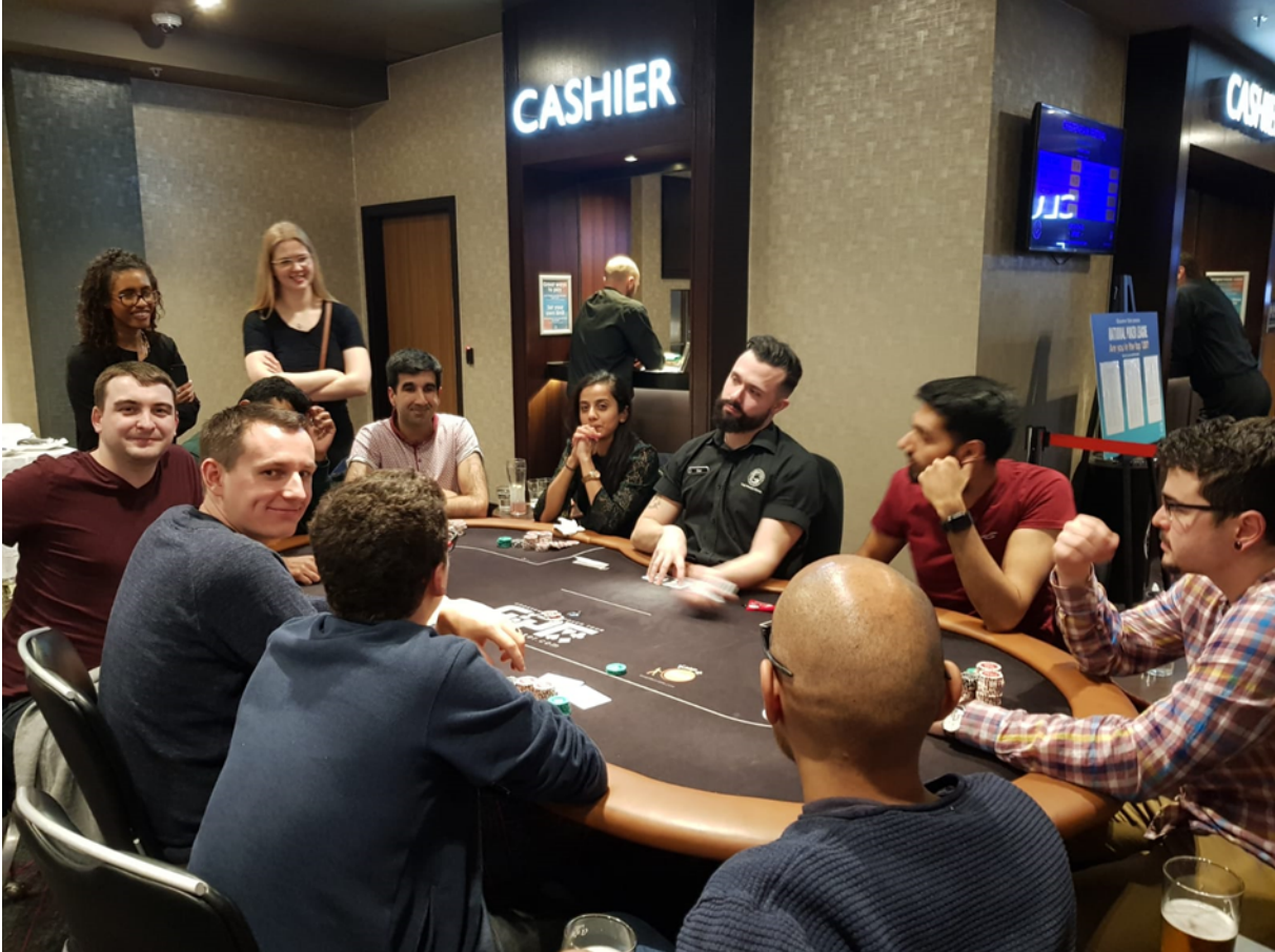
The final table, Poker Tournament, March 2020